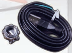
Power Cord Kit 1024