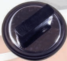
Fits-All Stopper 1027