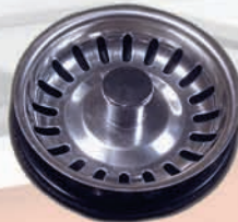
Strainer/Stopper for 3-Bolt Mount Disposers 4009