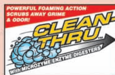
Clean-Thru Cleaner & Septic Treatment 5101