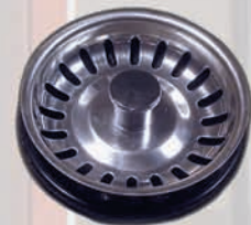
Strainer/Stopper for EZ Mount Disposers 4015