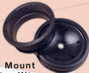
3-Bolt Mount Adapter Kit 3101